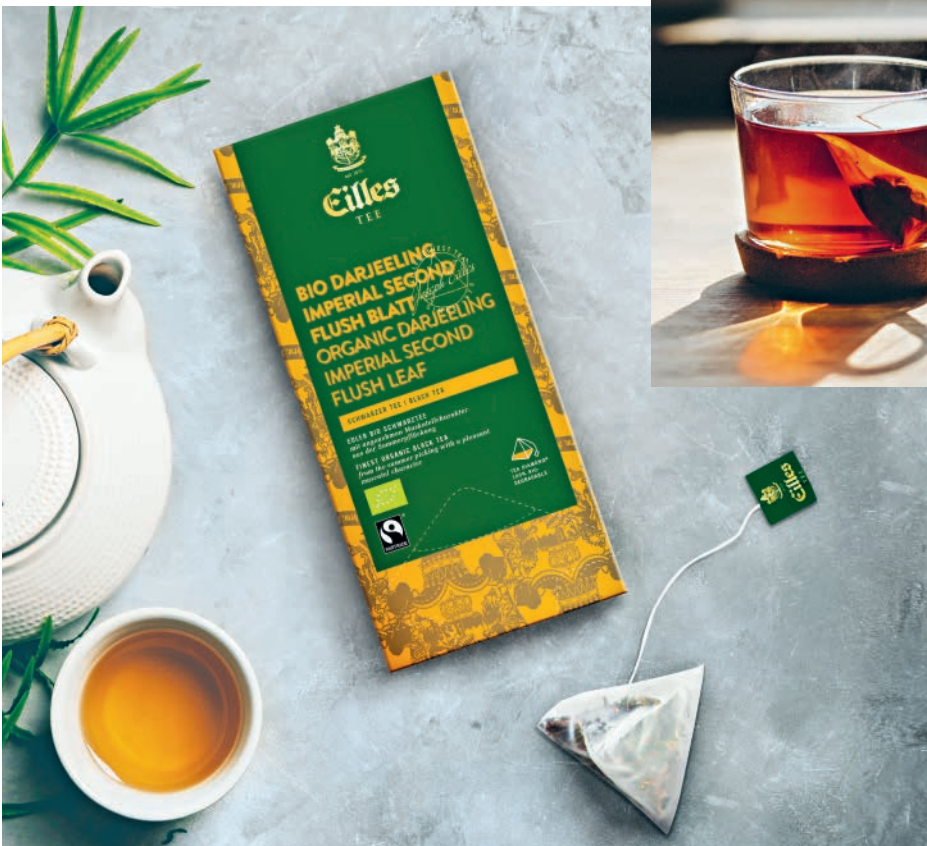
Tea Diamonds in the Luxury World Selection – Young Line