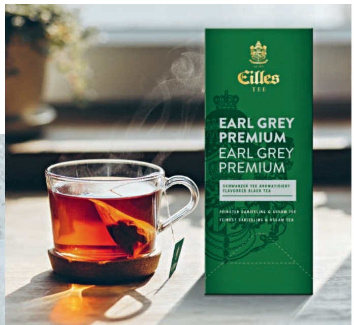
Teabags in paper or foil envelope